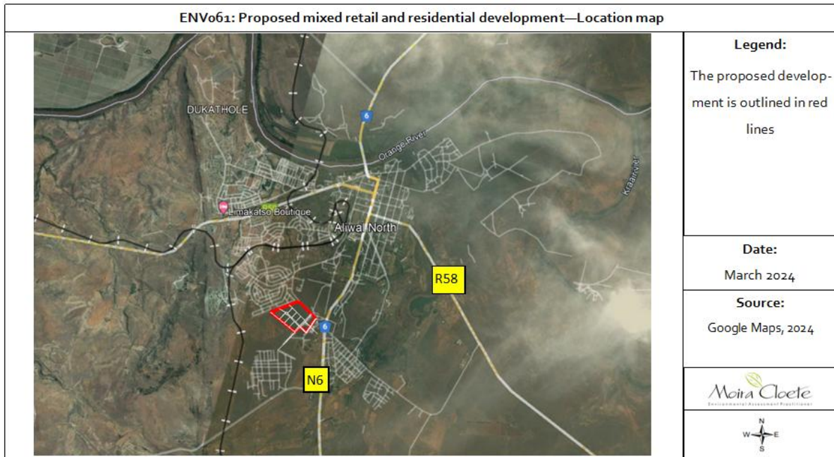
Umzobo 1: Isicwangciso esisisiseko sendawo yophuhliso olucetywayo.